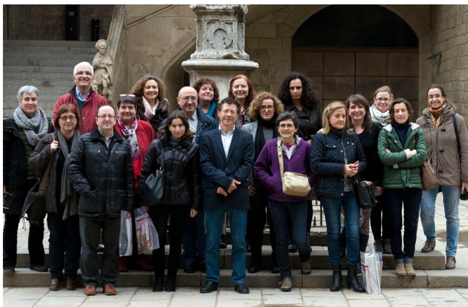
Some of the people attending the meeting

In 2015, our annual meeting was held in Barcelona, at the Library of Catalonia, on Saturday March 21st. As usual, the day before, Friday the 20th, commissions and working groups also met in the same venue.