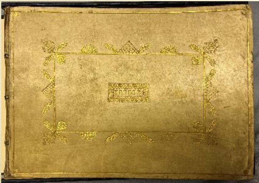
The Treble part of the Magdalene College Partbooks