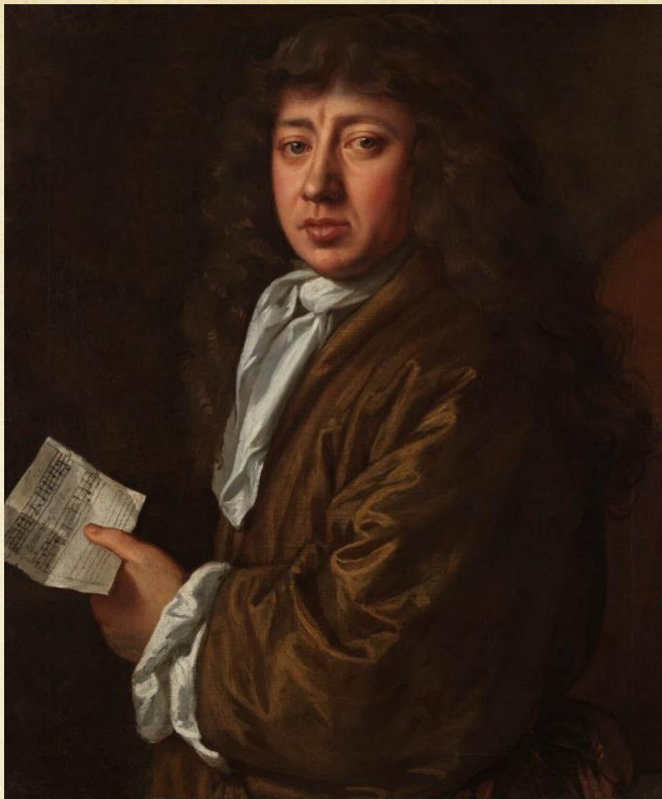
Samuel Pepys by John Hayls