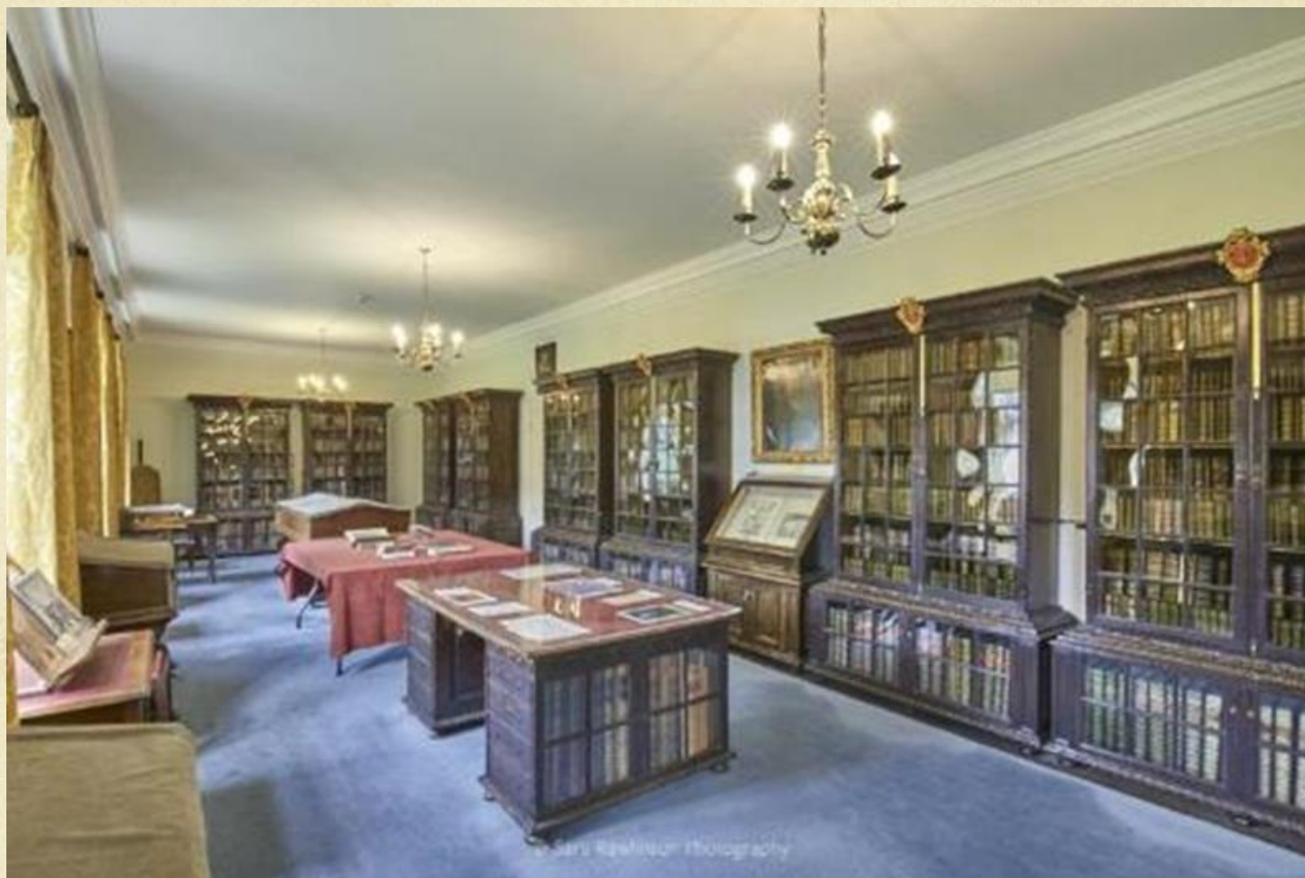
The Pepys Library