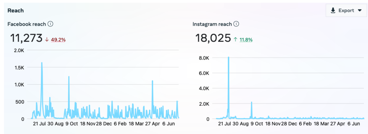
Figure 2: Facebook and Instagram reach

Figure 2 shows Facebook Page Reach. Reach is the number of people that have seen your content within a certain period.