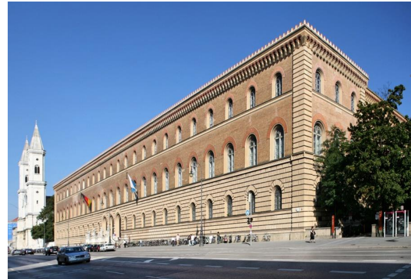
The Bavarian State Library in Munich in Ludwigstraße next to Ludwigskirche,