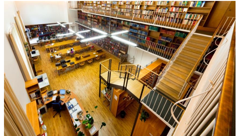
The music reading room of the Bavarian State Library

In the second project phase since 2017 in cooperation with SLUB Dresden and with the new name „musiconn“