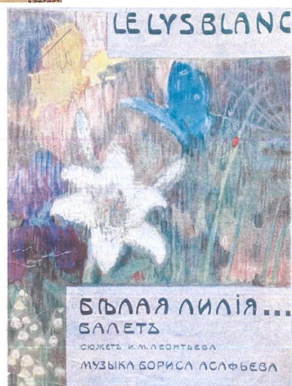
Рис. 12. Обложка издания «Асафьев Б. В. Балет «Белая лилия»». Санкт-Петербург, Москва, 6 г.