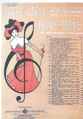
Рис. 11. Обложка издания «Нюф-нюф». Новое собрание любимейших из новых шансонеток». Санкт-Петербург, конец XIX в.