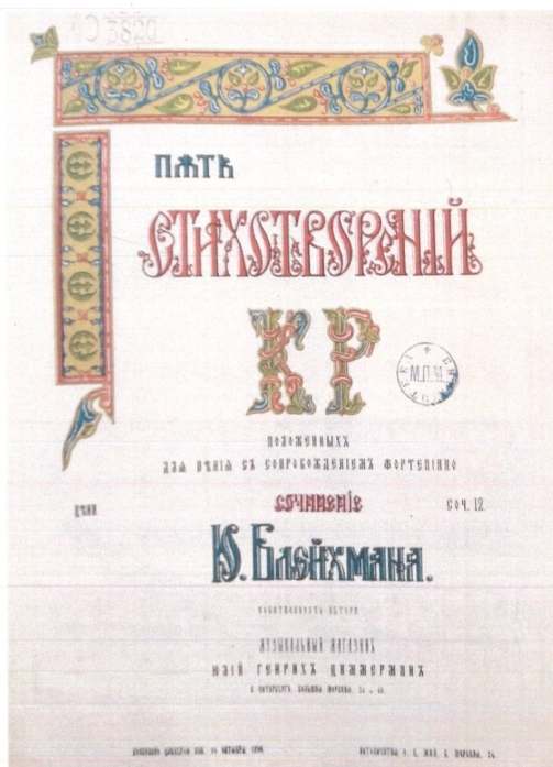
Рис. 5. Обложка издания «Блейхман Ю. Пять стихотворений К.Р., положенных для пения в сопровождении фортепиано». Санкт-Петербург, 1894 г.