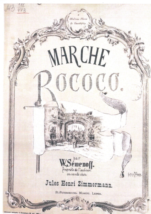
Рис. 8. Обложка издания «Семенов В. Марш рококо». Соч. 5. Санкт-Петербург, 1888 г.