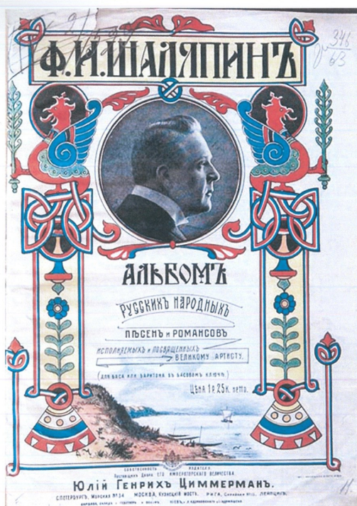
Рис. 7. Обложка издания «Ф. И. Шляпин. Альбом русских народных песен и романсов, исполняемых и посвященных великому артисту». Санкт-Петербург, 1903 г.