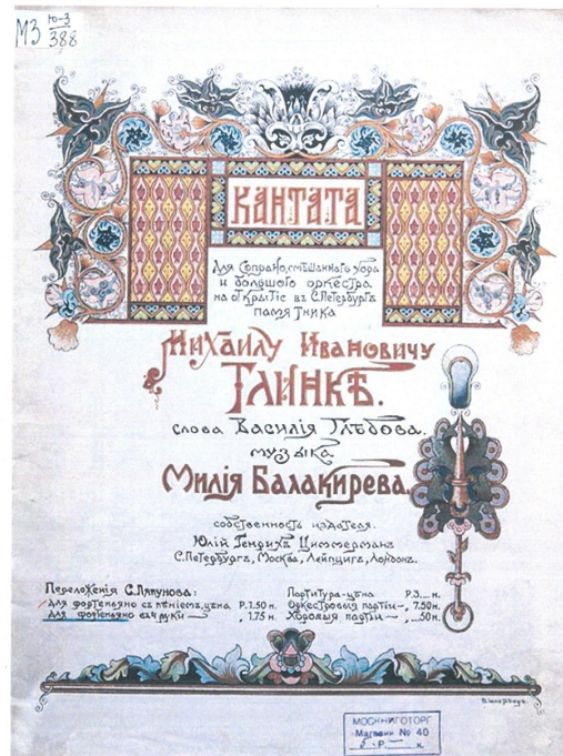
Рис. 6. Обложка издания «Балакирев М. А. Кантата для сопрано, смешанного хора и большого оркестра на открытие в С. Петербурге памятника Михаилу Ивановичу Глинке». Б. м., 1904 г.