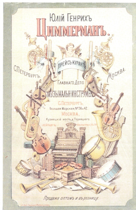
Рис. 13. Обложка издания прейскуранта «Юлий Генрих Циммерман. Главное депо музыкальных инструментов». 1900-е гг.