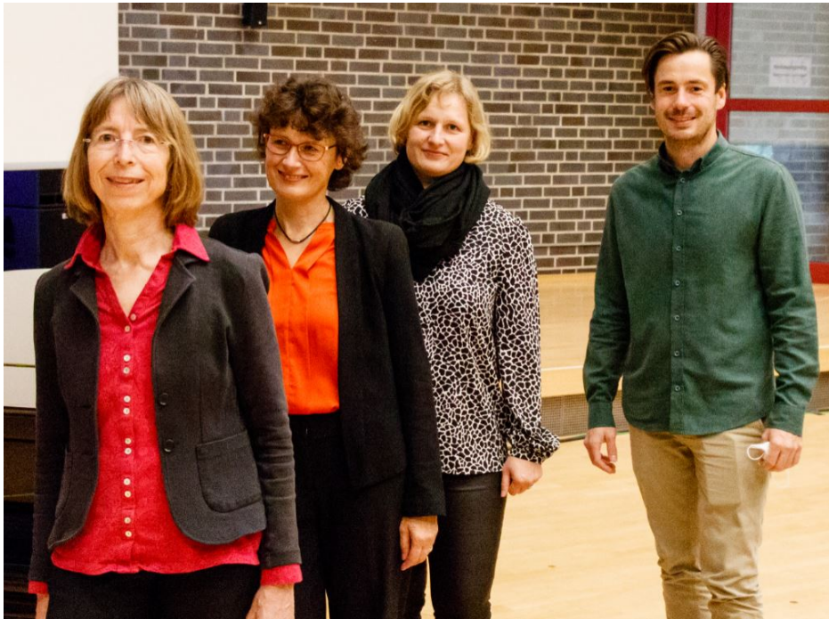
National Board members