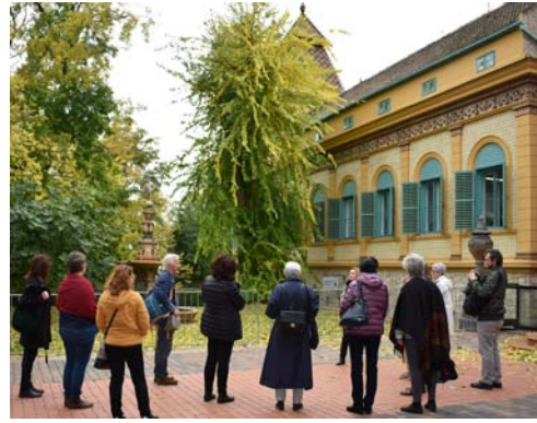
In the Zsolnay quarter