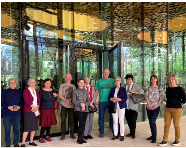
At the entrance to the House of Music