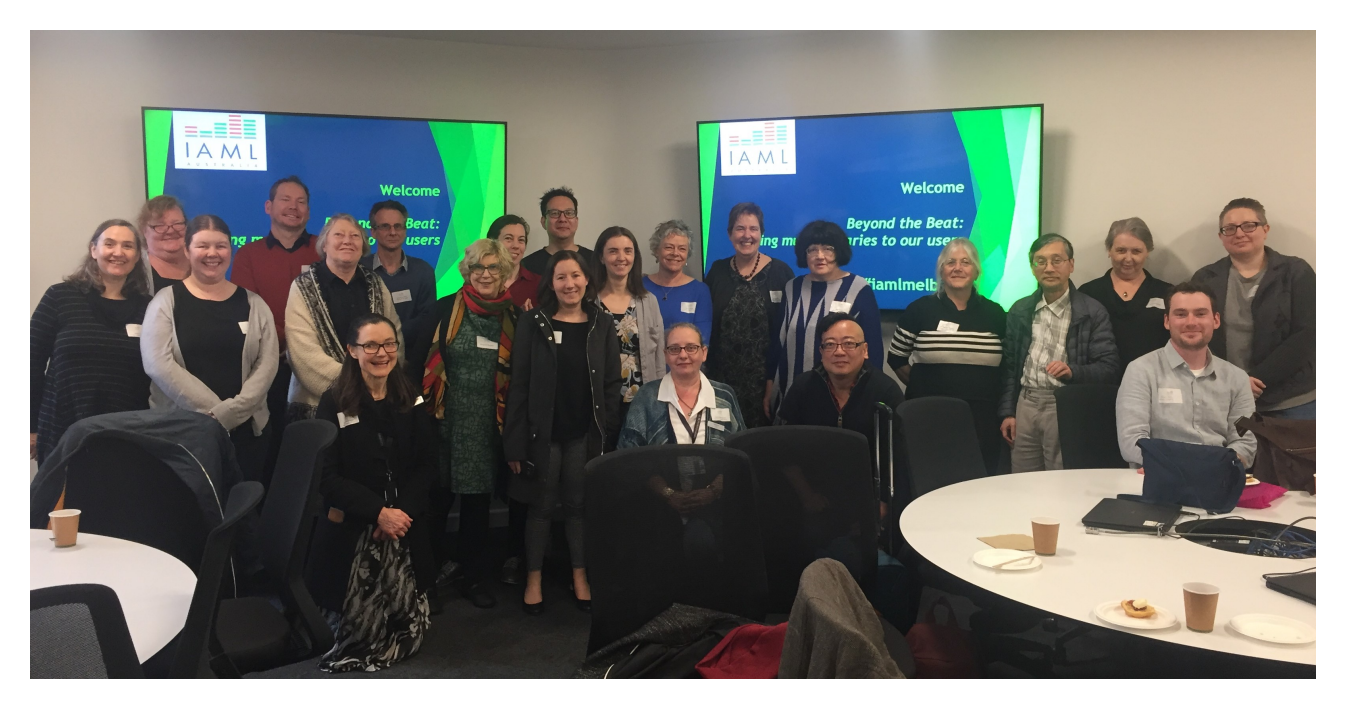
Delegates at the Biennial IAML Australia Conference October