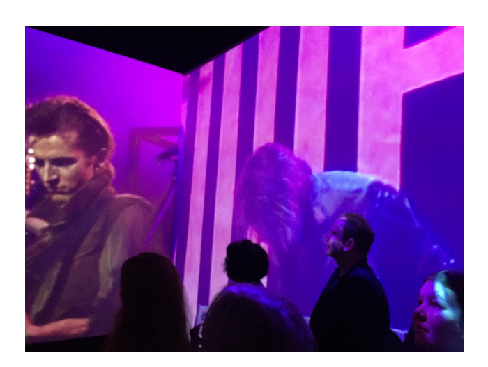
Conference delegates attending the tour of the Australian Music Vault, Performing Arts Museum at the Victorian Arts Centre. October 2019