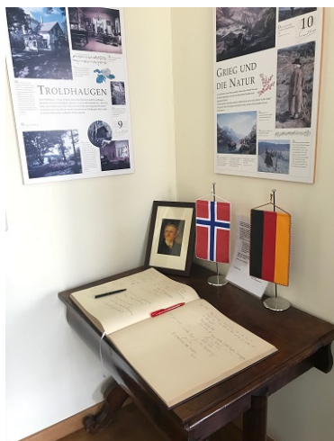
Illus. 7: From The Grieg apartment at Edition Peters