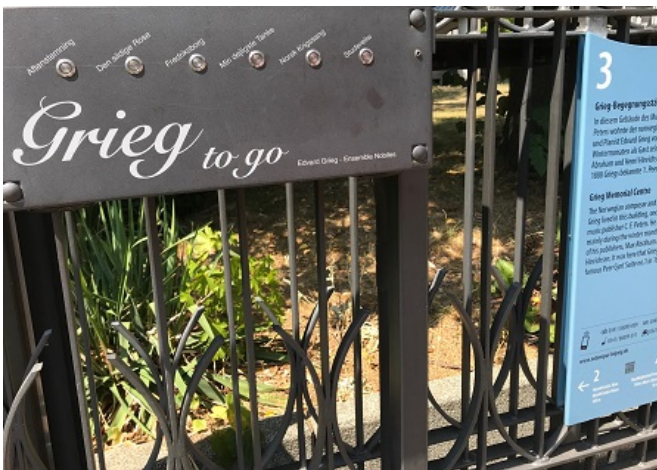
Illus. 5: Grieg sound installation in the street