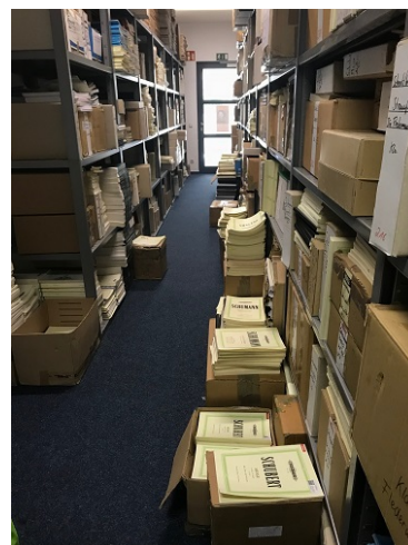
Illus. 9: From Edition Peters' Hire Library